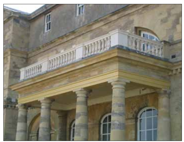
Old Hall Balcony repairs