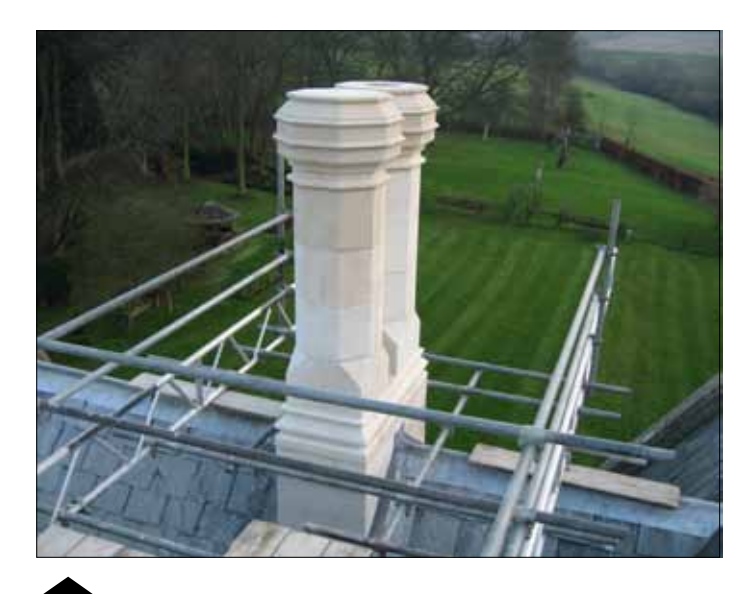
The ornamental masonry chimneys were completely replaced on this old vicarage.